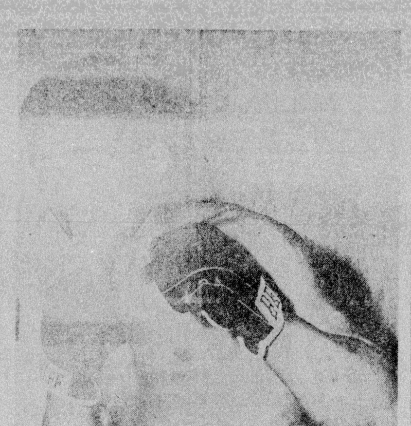
CHAMPION TITLE HOLDER —Already the holder of the British Empire welterweight, middleweight and light-heavyweight boxing crowns, ring master Randy Turpin may soon add the world's middleweight title to his string. The retirement of "Sugar" Ray Robinson leaves his English conqueror (date reversed) the number one contender. Who wants to face him anyway?