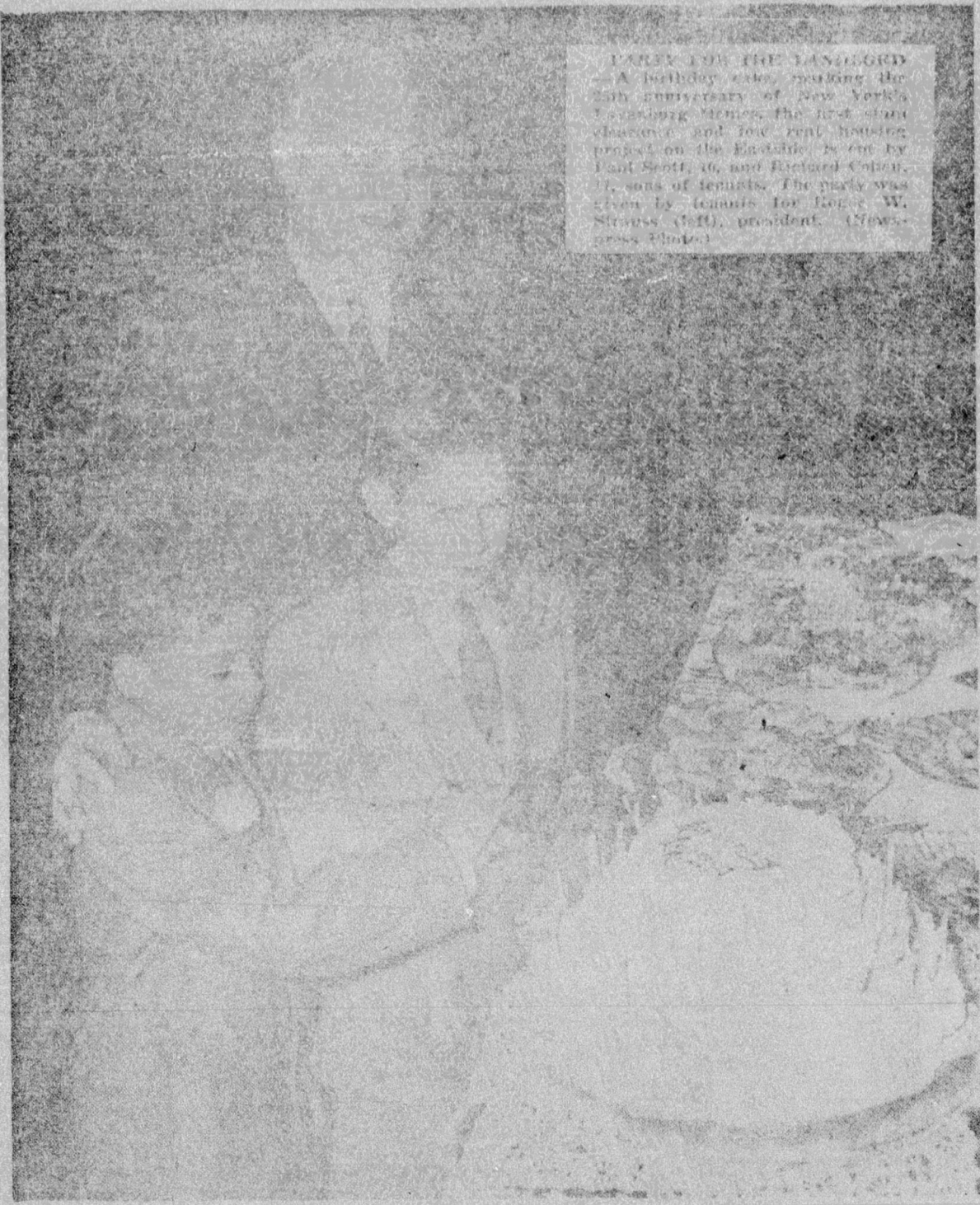
PARTY FOR THE LANGUARD... A birthday party... the 43rd anniversary of the Boy Scouts of America...