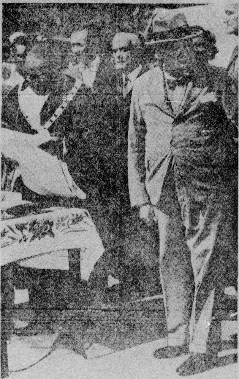
TIGHT SQUEEZE - Mayor Edward Fagan of Kingston, Jamaica is delivering an address of welcome to British Prime Minister Winston Churchill, but the chubby Premier (note tight squeeze in jacket) seems to be more interested in something else off the picture...