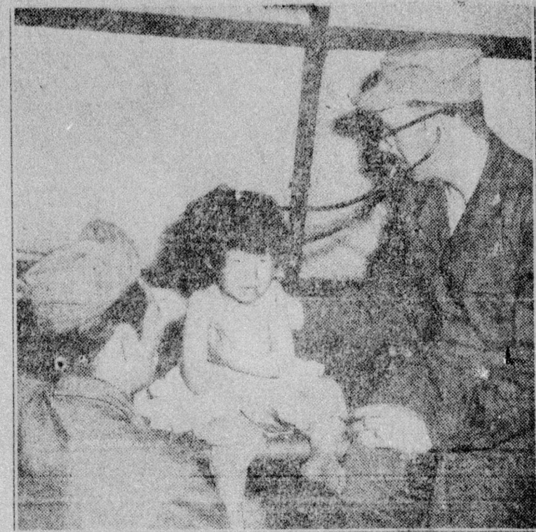
SAD, LONELY AND BEWILDERED, this Korean waif is a living example of the tragedy of war. Shown being examined by a U.S. Army medical officer, the little Korean girl is but one of many orphans of war to receive medical assistance from Army doctors in Korea.