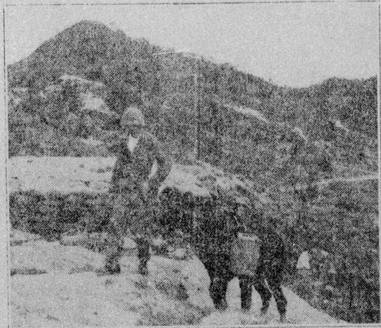
FREDDY FINDS NEW FRIENDS - Freddy the mule deserter from Communist forces, now carries ammunition for U.S. Seventh Infantry Division soldiers who found him in the Korean hills.