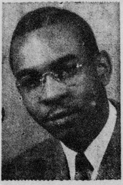
ATTY TAYLOR Will Try Again