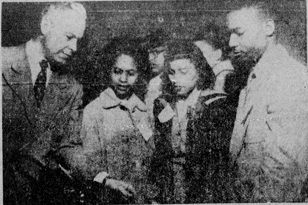
LILLINGTON, N. C. — STUDENTS SEE BUSINESS EXHIBIT — These three students at Shawtown High School, Lillington, N. C., were among delegates to NCC's Second Annual Commerce Day observance in...