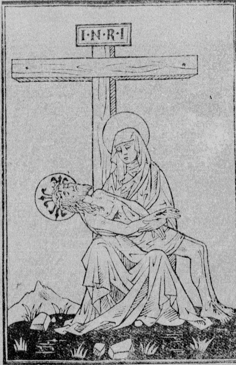
Now He Is Risen