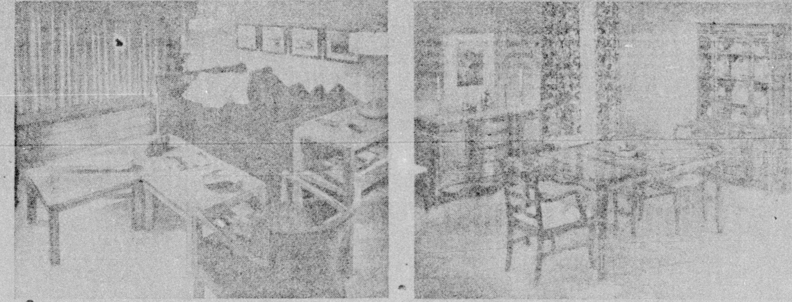
Modern furnishings in a driftwood finish emphasize this double-duty room—living by day, bedroom at night. Toss pillows transform the same headboard bed into a daytime sofa. Low cabinets provide seating and storage. Coffee tables are portable to give added convenience. Charles R. Shigh Co.