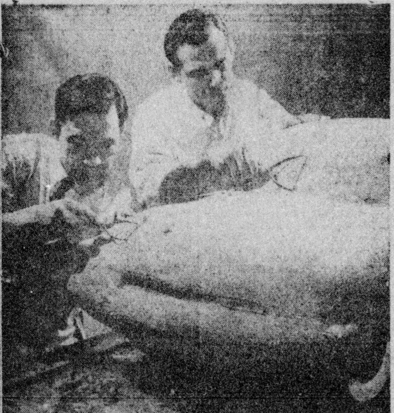
Ford Motor Company engineers and design stylists, such as this expert clay model team, work on the theory that to stand still in the auto industry is to move backwards. Today's research results in the finer cars America will drive tomorrow.