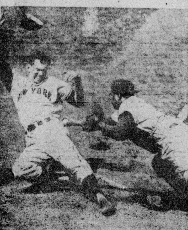
TAG, YOU'RE IT! —Leaving his cap flying behind, the New York Giants' Daryl Spencer is a dead duck, as he lunges into "Old Gibraltar," Roy Campanella of the Dodgers during a renewal of baseball's bitterest rivalry at Ebbets Field last week. The return, but solid Campanella may enjoy his best year. He's hit four homers already.