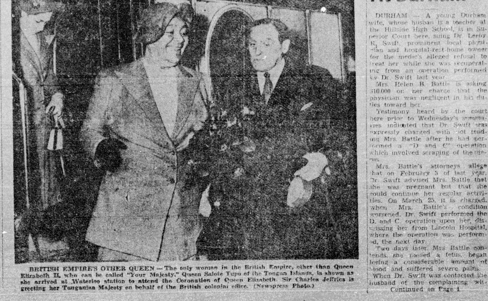
BRITISH EMPIRE'S OTHER QUEEN — The only woman in the British Empire, other than Queen Elizabeth II, who can be called "Your Majesty," Queen Salote Tupou of the Tongan Islands, is shown as she arrived at Waterloo station to attend the Coronation of Queen Elizabeth. Sir Charles Jeffries is greeting her Tongan Majesty on behalf of the British colonial office.