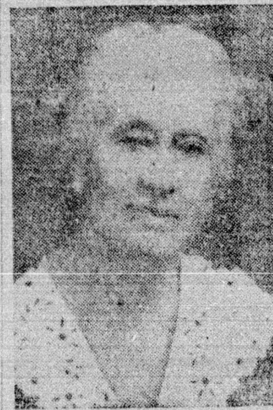
SHE'LL BE 90 OCTOBER 10 — The fabulous Mrs. Mary Church Terrell, probably the most valiant fighter for civil rights in the nation, will be 90 years old October 10. Friends and admirers will honor her on that day with a luncheon at the Statler hotel in Washington, D. C.

RALEIGH — It is hoped locally that a sufficient number of Negro men will qualify for the position of fireman during the next few weeks to man the Auditorium Fire Station.