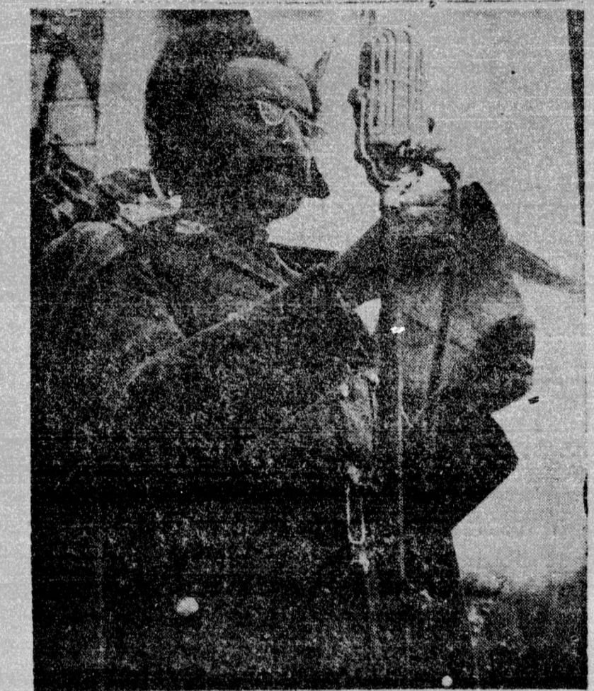
HEADED FOR U.S. — The "Lion of Judah," His Highness Haile Selassie, Emperor of Ethiopia, is rumored to be headed for these shores at the invitation of the State Department.

WILSON (Special) — Three men were shot fatally and another was badly injured by gunfire in a week end series of shooting streets in and near Wilson last week.