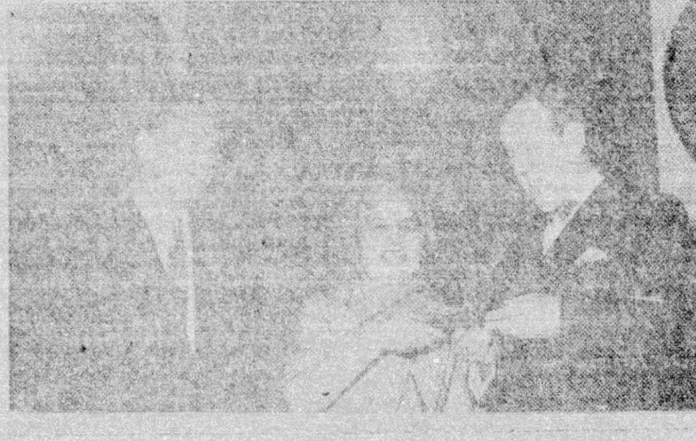
Mrs. Pandit Takes Over as Assembly President

The meetings of the United Nations General Assembly will now come to order when Mrs. Vijaya Lakshmi Pandit, of India, takes the gavel. She is the first woman to preside over the assembly. Mrs. Pandit is the first woman to preside over the assembly. She is the first woman to preside over the assembly. She is the first woman to preside over the assembly. Mrs. Pandit is the first woman to preside over the assembly. She is the first woman to preside over the assembly. She is the first woman to preside over the assembly.