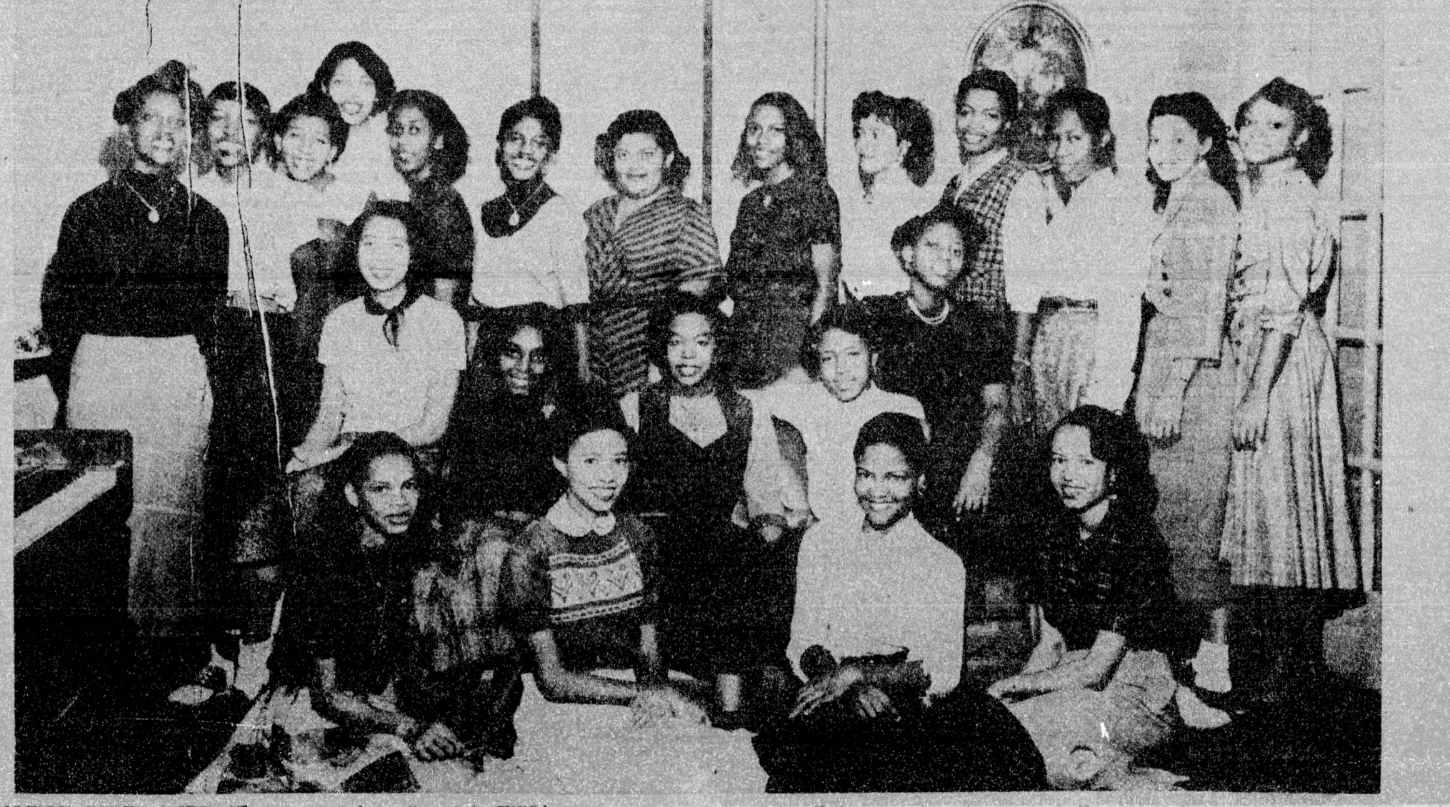
RALEIGH DEBUTANTES AT CHARM CLUB MEETING — Local young ladies who will make their bow into society on Friday night, November 27 are pictured here as they attended a