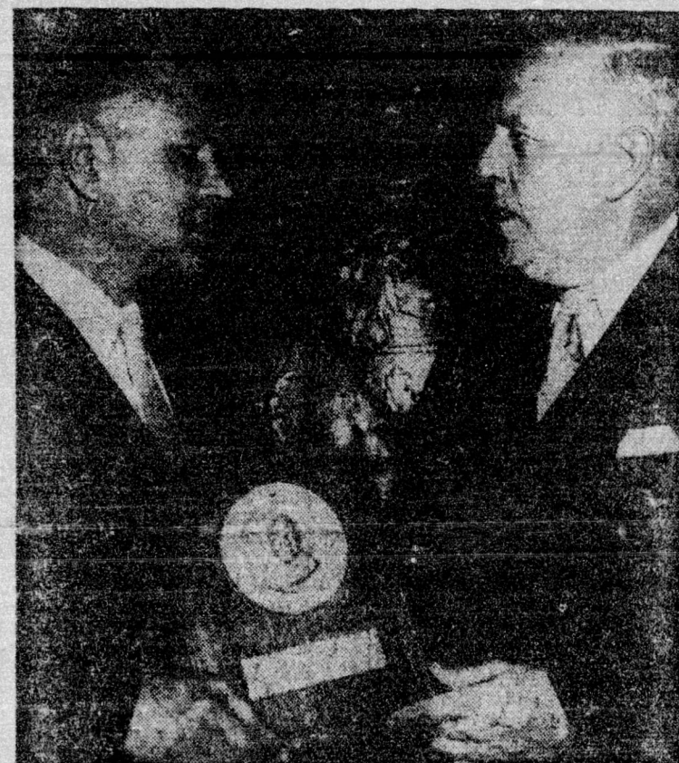
DR. BUNCHE PRESENTS CARVER AWARD—Dr. Ralph Bunchie is shown presenting the 1953 Gold award of the George Washington Carver Memorial Institute to Paul G. Hoffman (right), chairman of the board of the Studebaker corporation. The award is given annually by the institute for outstanding contributions to the betterment of race relations and human welfare. Presentation was a highlight of Carver Day ceremonies at the Waldorf-Astoria hotel in New York recently.