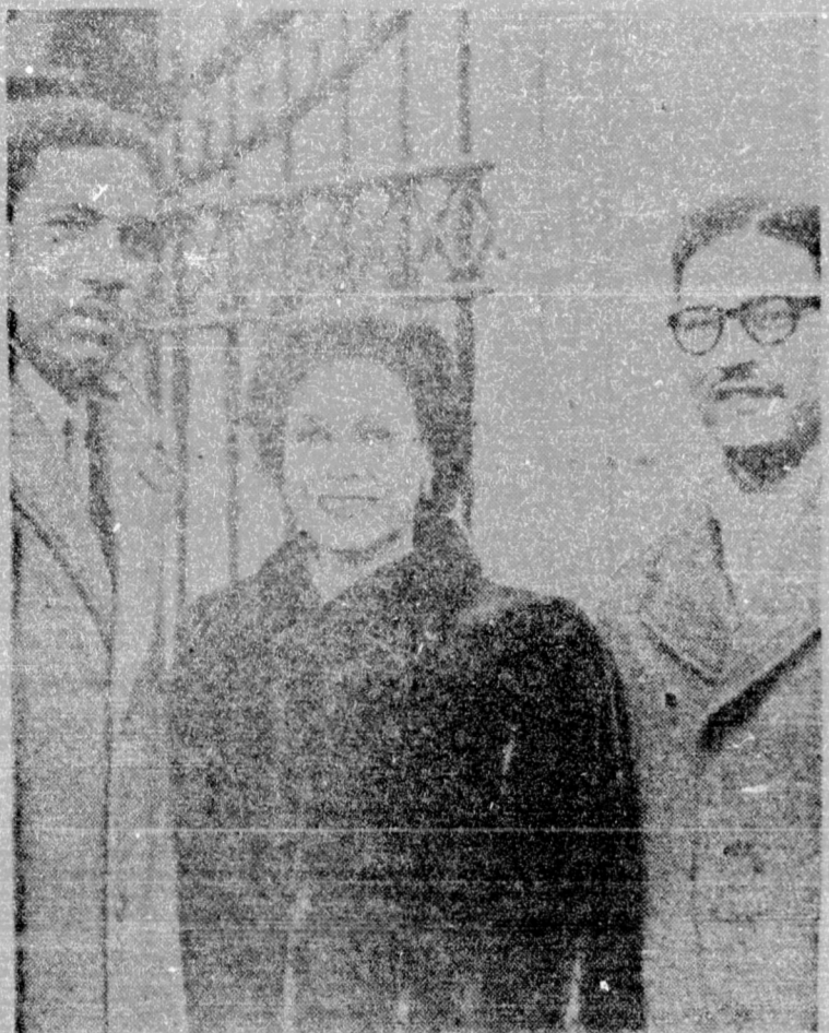
HONORED BY QUEEN—Arthur Wint (left), Jamaica's most celebrated runner, is shown with his wife and brother at the gates of Buckingham Palace before Wint went to the investiture held by Queen Mother Elizabeth. Wint was honored with the Order of the British Empire.