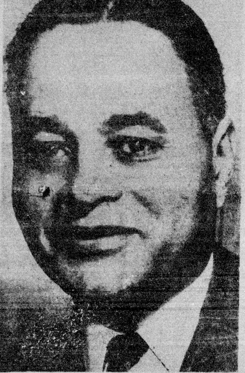
QUEZZED ON LOYALTY — United Nations Trusteeship director, Dr. Ralph Bunche, winner of the Nobel prize and many notable awards, spent 12 hours with the International Organization board during a review of alleged Communist affiliations held in New York last week. Dr. Bunche, who later journeyed to Washington to attend a dinner party given by Emperor Haile Selassie by President Eisenhower, would not reveal what line of questioning had been taken by this investigating committee.