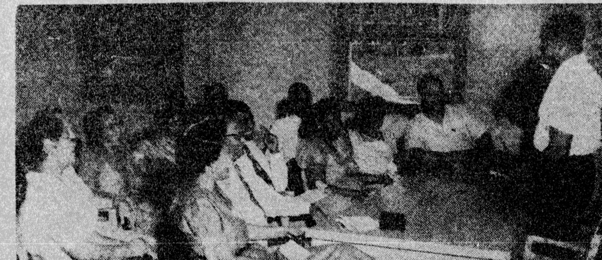
NATION'S FIRST GROUP CONFERENCE DEVOTED EXCLUSIVELY TO PROBATION — Pictured above is the first group of persons in the East to participate in a college-