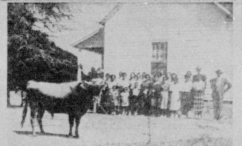
The economies of the county program can be seen in this picture. This registered bull was purchased by a ritual community and aids in the production of cattle for the entire community. He is known as the "Community Bull."