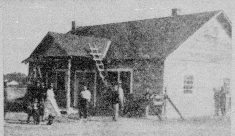
The people of the Shiloh Community had only the church to meet in for their community work, but a group of them went to work and shown above is the Club House that has been built. The community program has grown steadily since the completion of the building.