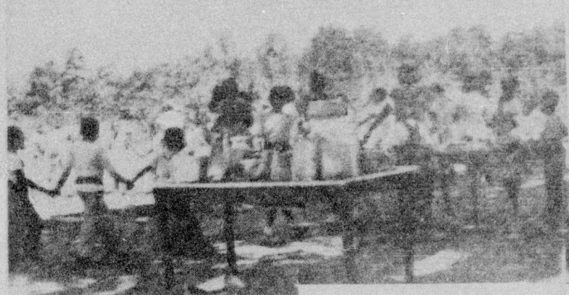
These 4-H members are shown as they enjoy their annual picnic at the Cary School. These young and enthusiastic children prove that "all work and no play make Jack a dull boy."