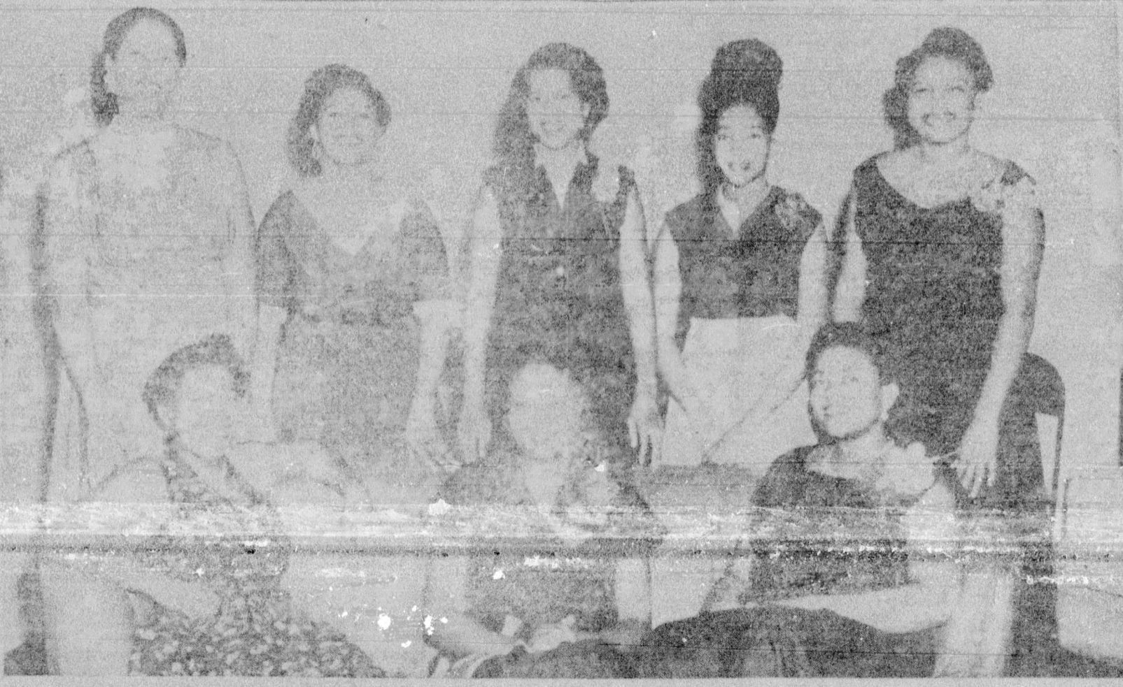
NEW CLUB ORGANIZED Pictured above are members of the Fidelity Social Club of this city who appeared at a recent gathering. The club, which is composed of young matrons