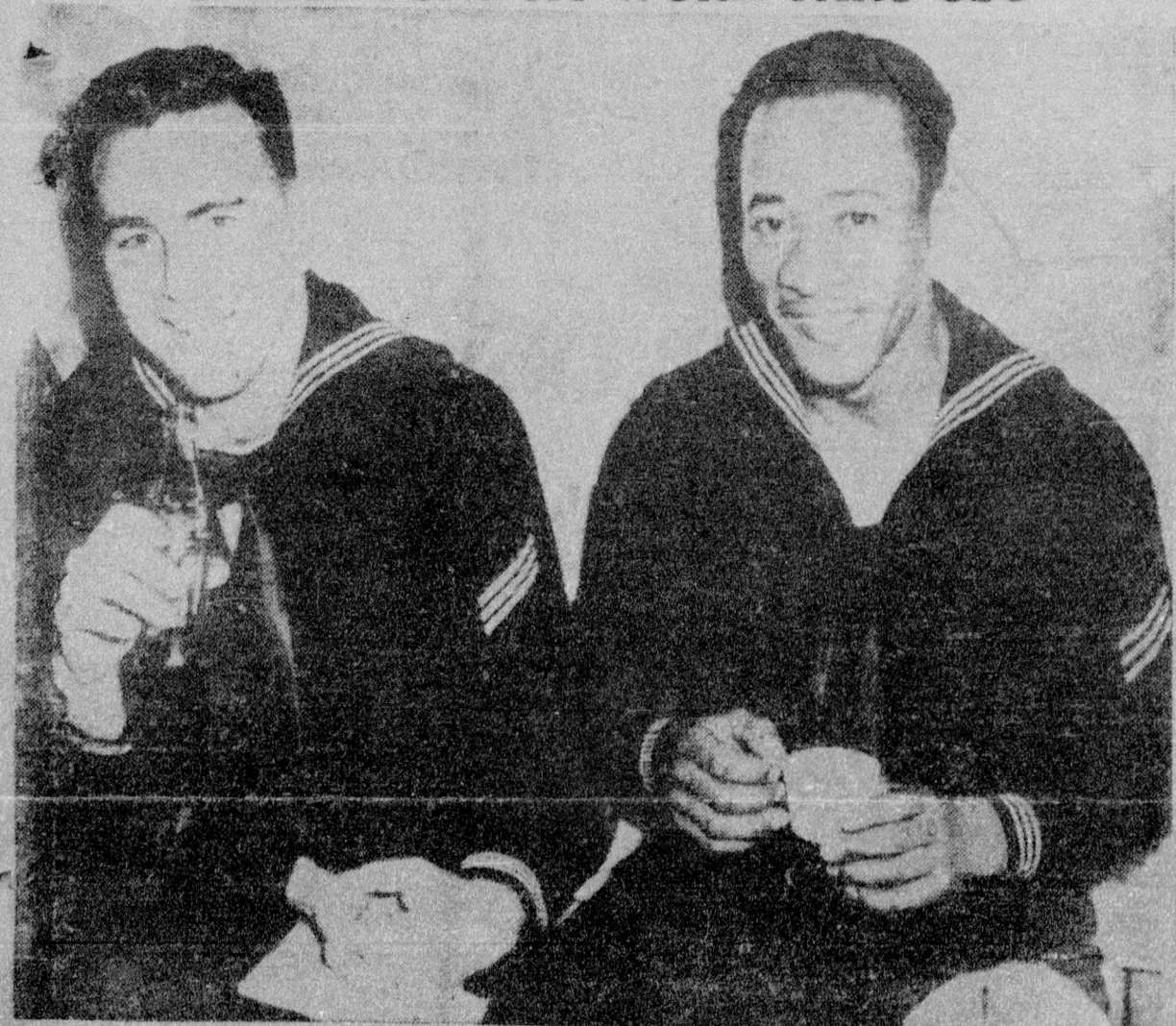
U.S.O. - a United Fund Agency