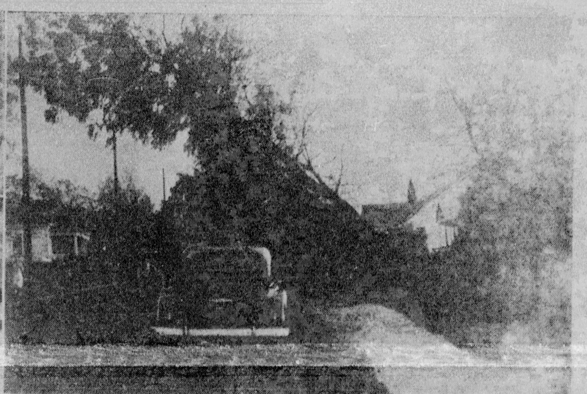
AFTER "HAZEL" LEFT the city last weekend the following scenes were caught by a CAROLINIAN cameraman. The photo on the left shows a tree sprawled across the entrance to St. Agnes Hospital. The institution was without lights for several hours following the hurricane and water was reported ankle deep in some portions of the hospital. Several students at St. Augustine's College are pictured in the center photo surveying the damage to a late model convertible on the campus. The roof was lifted from the Lyman Building, a men's dormitory, and landed atop the car which was parked in front. In the photo on the right a tree is shown leaning far out into the street after being blown over by "Hazel's" 60-mile per hour winds. No local fatalities have been attributed to the hurricane, although residents report extensive property damage.