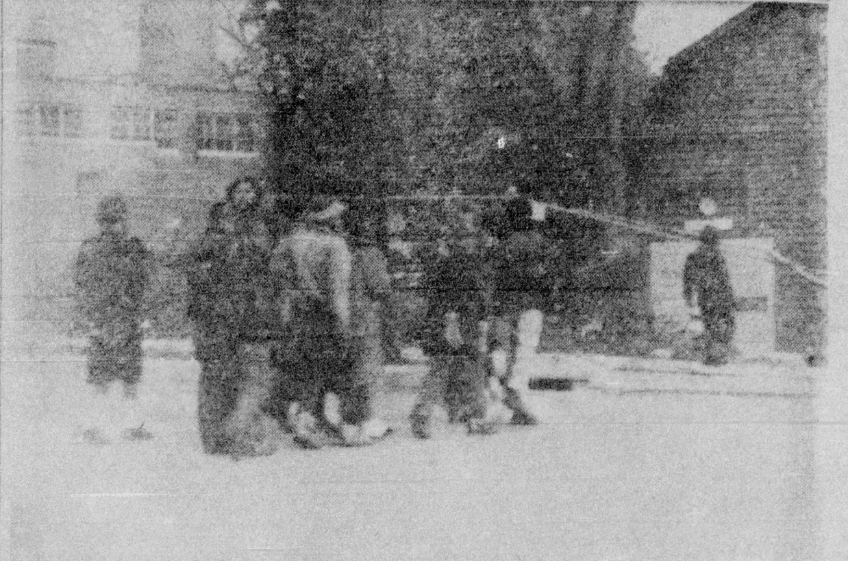
YOUNGSTERS GO TO SCHOOL — As indicated in the photo above, several students who attend the Washington School must cross at the intersection of Smithfield and Wilmington Streets. This four-lane highway presents a dangerous hazard to youngsters, especially those who fail to adhere to the warn-