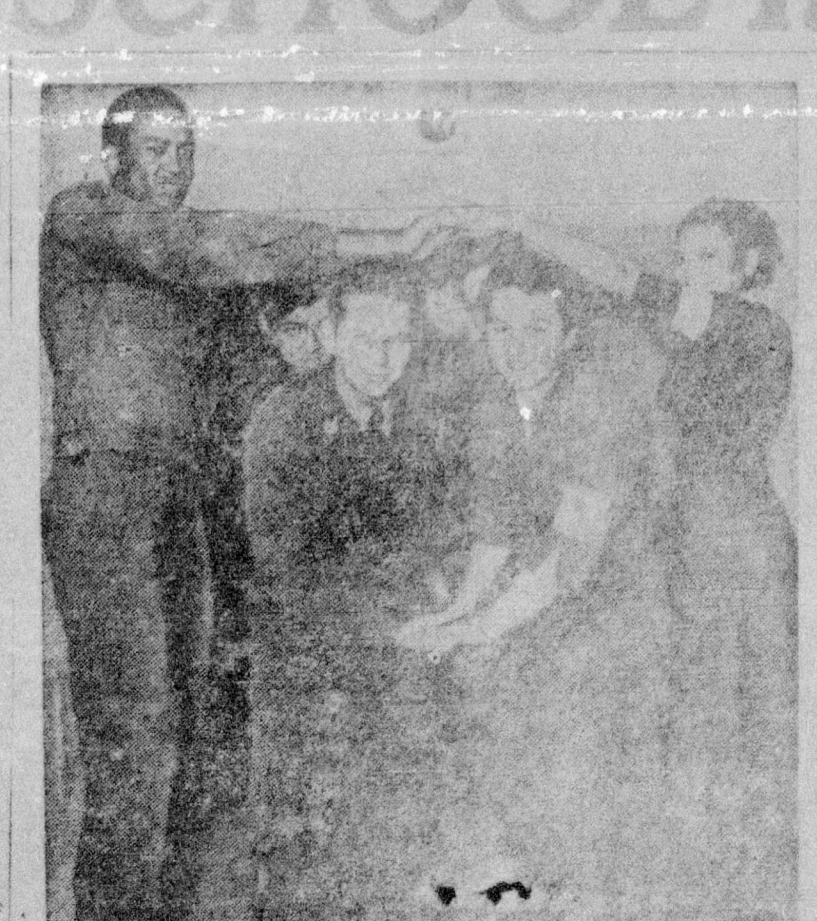
THROUGH THE TUNNEL -- It's a terpsichorean treat for men bers of Battery D. 606th Anti-Aircraft group, stationed on Grand Island, as the Buffato, N. Y. USO committee sponsors another of its Junior Hostess dances on Grand Island. The dunies are held three times monthly, and are the most popular acti USO, which is supported through Community Chest and United Fund