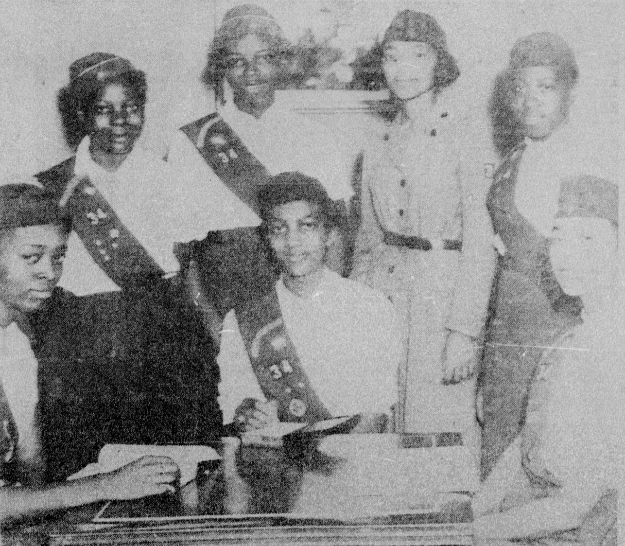
GIRL SCOUTS OBSERVE 3RD BIRTHDAY — Pictured above are a group of Senior Girl Scouts of troop 2-34, Clayton, as they made plans to celebrate Girl Scout week, which