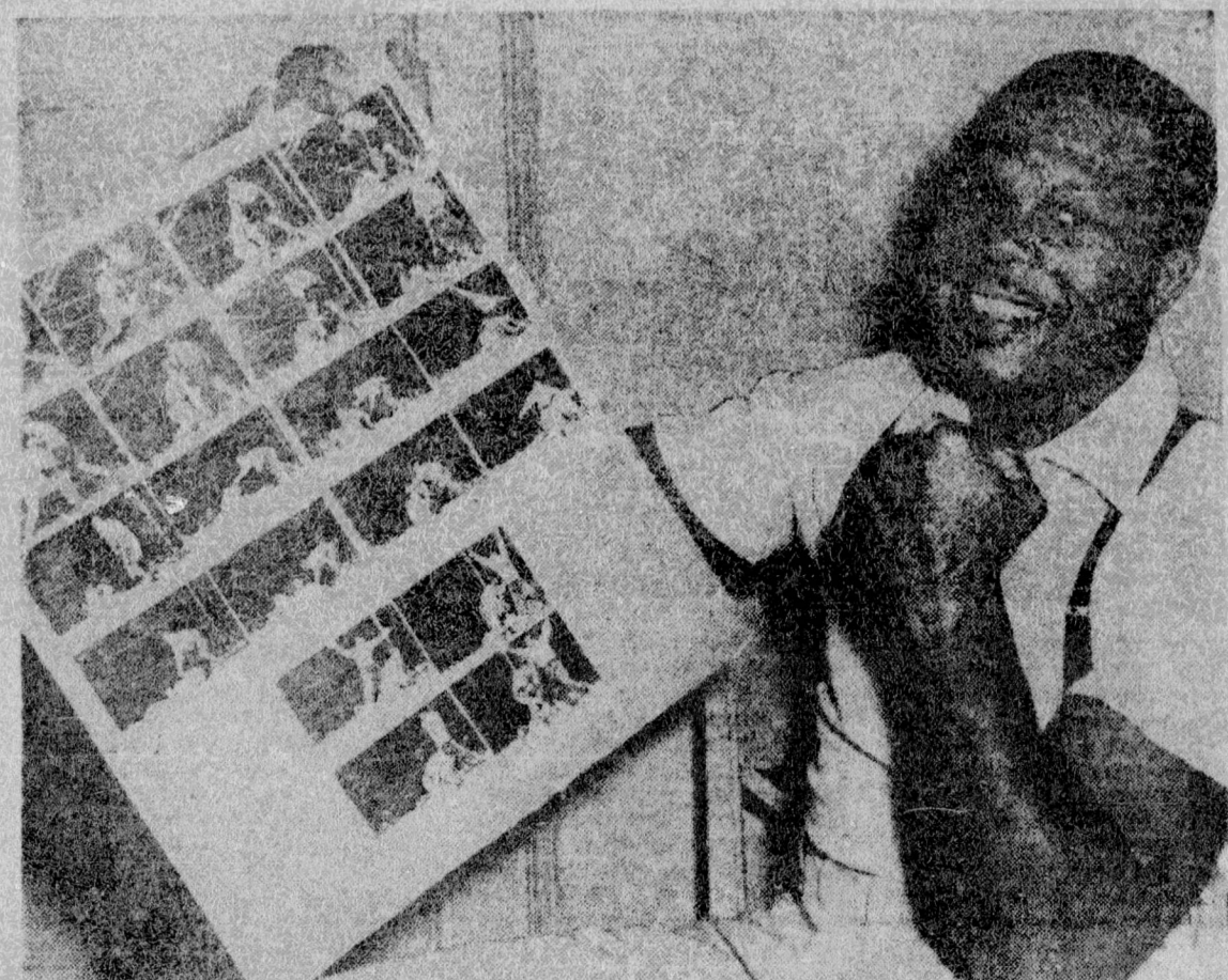
"ROCKY" ROAD AHEAD — Light heavyweight champion Archie Moore, flushed from the recent successful defense of his title against "Bobo" Olson, holds up the left hand which delivered the KO punch, and admires a sequence of pictures showing the knockout. The venerable boxer, who has long sought a chance to fight for the heavyweight crown, will finally get his chance against the titleholder "Rocky" Marciano in September.