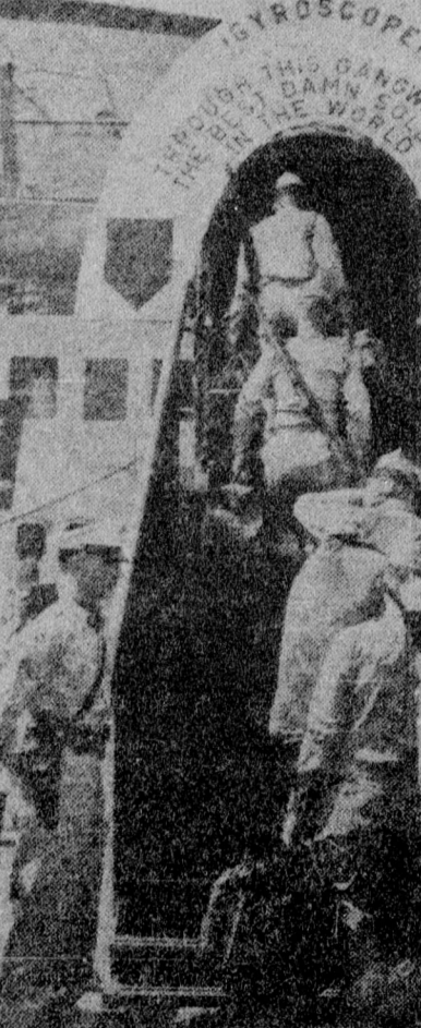
HOMEWARD BOUND — A few of "the best damn soldiers" (see men) who are also members of the 16th Infantry Regiment, First Infantry Division, file up the gangplank to board the USS Upshur in Bremerhaven, Germany. The ship brought them to the United States as the first contingent of the First Division under Operation Gyroscope, the Army's new rotation plan. Two more units follow this summer, and like the first, will exchange stations with the 16th Infantry Division at Fort Riley, Kans.