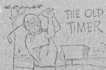
"Some people are like hot-fritters. They soak it all in, but get it backwards!"