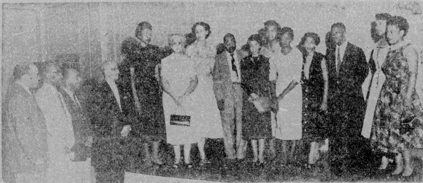
NEW APPOINTMENTS—Members of the new faculty and staff at North Carolina College are shown here receiving