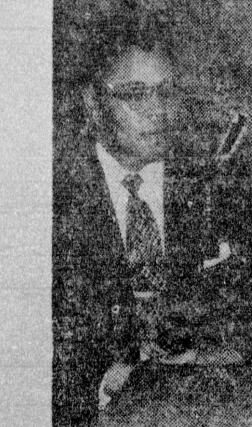
NAACP LEGAL EXPERTS — Legal experts of the National Association for the Advancement of Colored People got together at Durham Saturday to compare briefs filed in federal

Raleigh's municipal laborers became organized last Thursday night after receiving a charter from the American Federation of State, County and Municipal Employees Union (AFLE), at a meeting