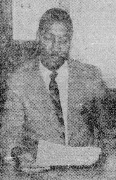
Hooded Men Shoot 12 In Fla. Town — UMATILLA, Fla. — Four hooded