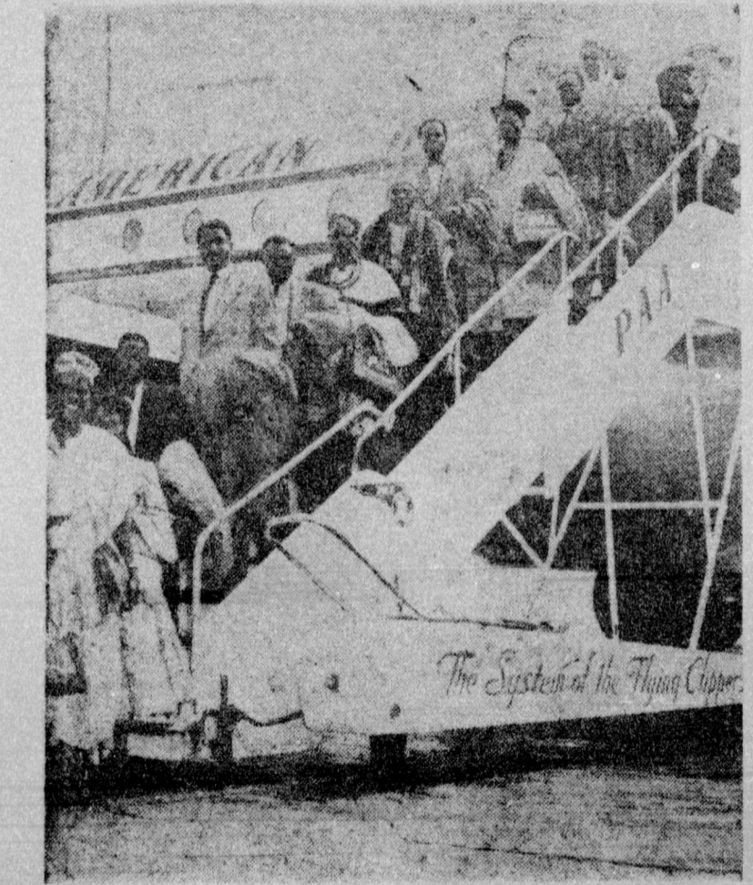
HOMeward BOUND — Sponsored by the Nigerian government, these leading African agriculturists arrived in the United States six weeks ago to study our agricultural advances. They visited five states and a number of fairs during their stay. The African experts are shown boarding a plane at the New York International airport before a trip to London and return home.