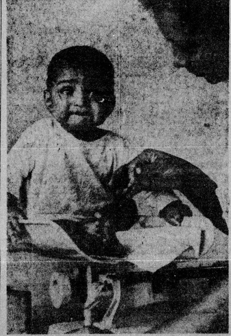
GOOD START IN LIFE — At least one arm of the United Nations is not confined to debates and votes. The U.N. Children's Fund (UNICEF) is doing good all over the earth, as evidenced by this seven-month-old native of Managua, Nicaragua, being attended by a Public Health nurse at a center supported by UNICEF funds.