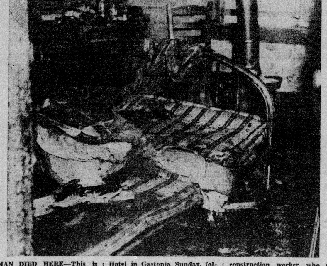
the scene that a photographer found when he visited the Plaza