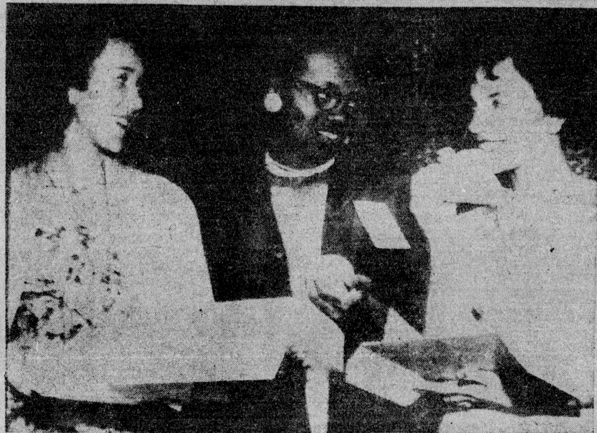
"QUICKY" LUNCH —With all of the business to be transacted in a single day, girls attending the annual convention of the North Carolina Homemakers of

America, held last week at A&T College, had lunch picnic style. The boxes, containing a tasty meal, were passed out to the more than 1600 youngsters in