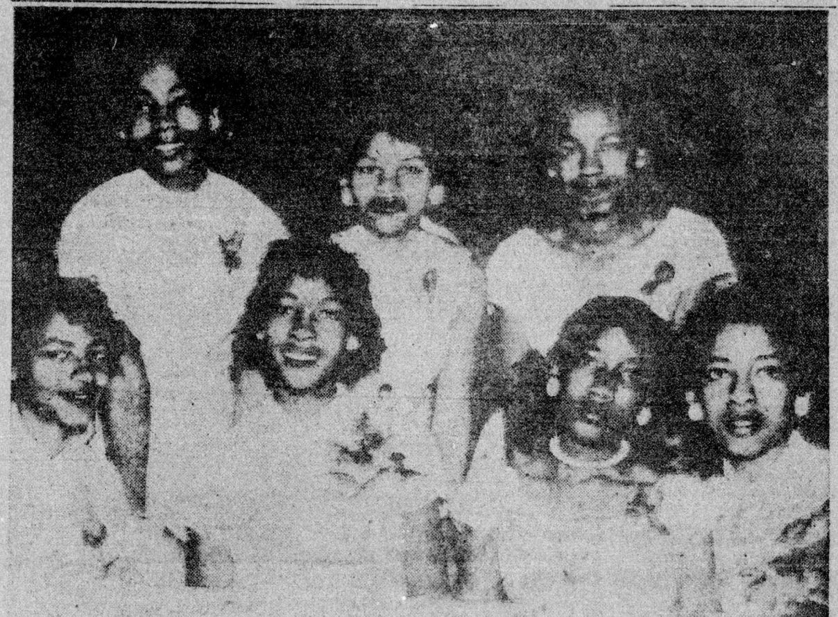
NEW HOMEMAKER OFFICERS —New officers to lead the North Carolina State New Homemakers of America for the next year, elected at the annual convention at A&T College last