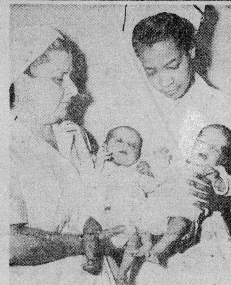
DOUBLE TROUBLE —Nurses in Brooklyn's Unity hospital hold twins, born April 1 with glaucoma, an eye malady which could destroy their vision. A specialist performed four swift operations to remove the obstructions. For the next three weeks the infants will have their eyes bandaged—and only after that will the doctor know if his efforts have been successful.