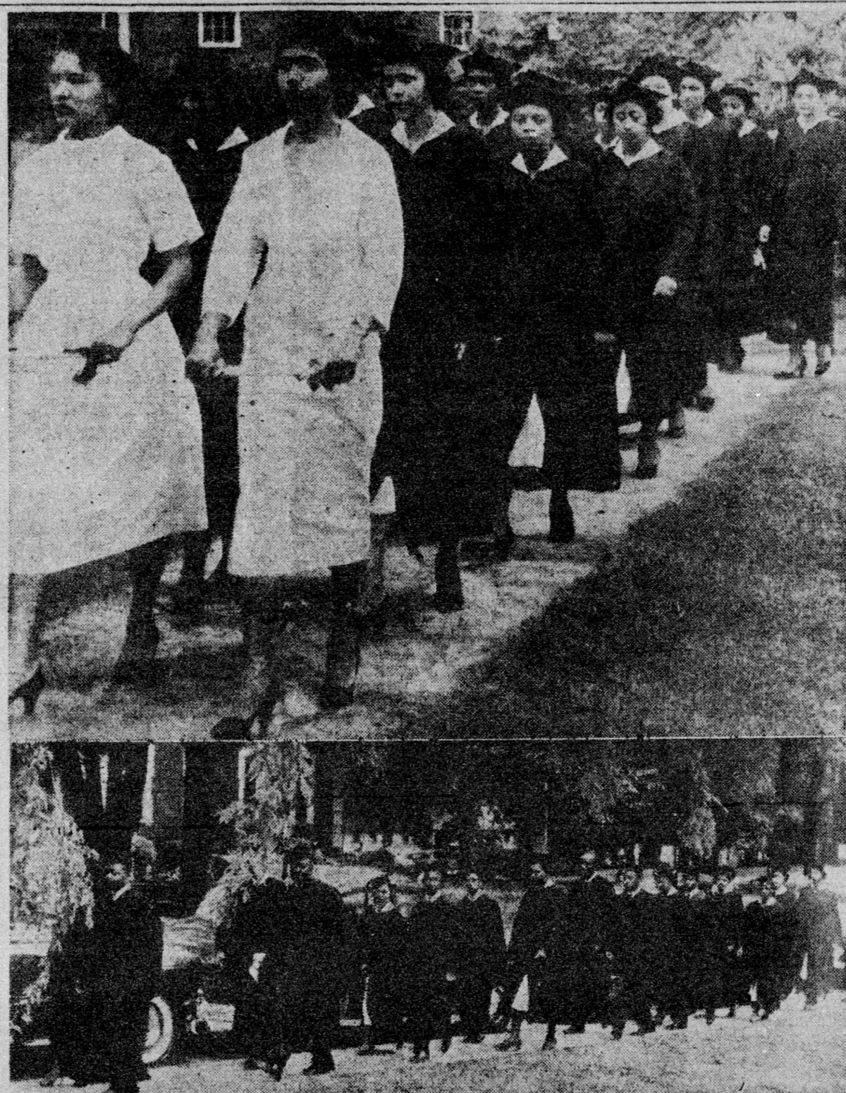
LAST LONG WALK — Members of the graduating class at Bennett College in top photo, marched through Bearden Gate for the last time on way to 83rd commencement exercises in Greensboro, Monday. Shaw University grads at Raleigh are shown in same procedure in bottom photo. Exercises were held at Shaw Monday also.