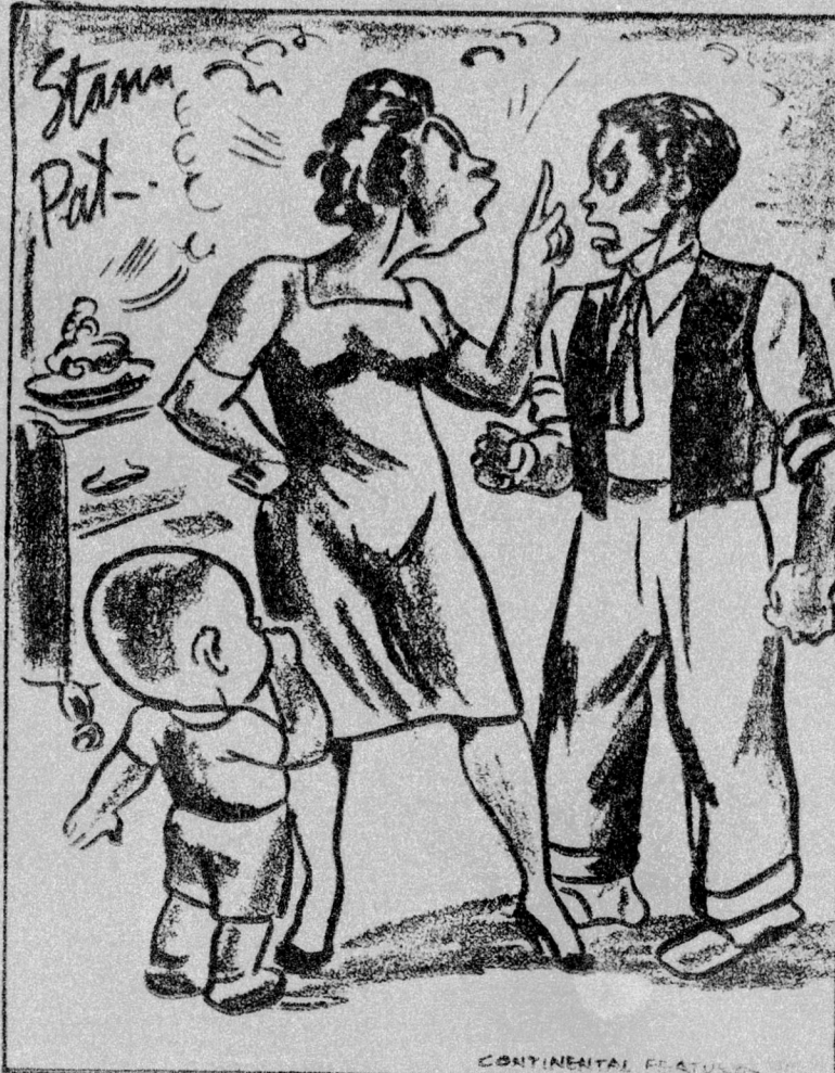
"Junior is listening. Do watch your language."