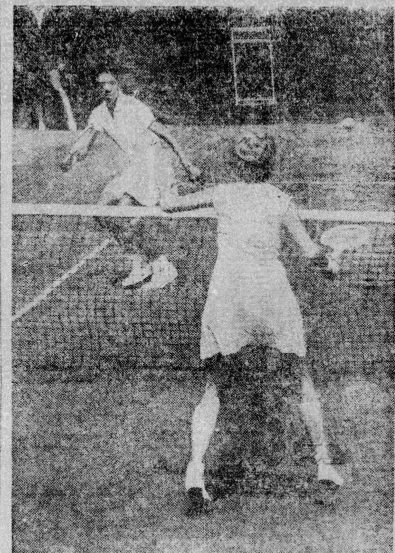
FAILS IN TRY FOR NATIONAL CROWN — Althea Gibson (far court) is shown returning across the court for a point as she played Mrs. Nell Hopman of Australia in the opening match of the National Tennis Championship at Forest Hills, N. Y., last week. Althea lost in her bid for the crown to Shirley Fry of Akron, Ohio, Sunday. She won over Althea 6-3 and 6-4. It was the third triumph of the year in four meetings for the steady Miss Fry over Miss Gibson, who hoped to become the first Negro to win a major U. S. net title.