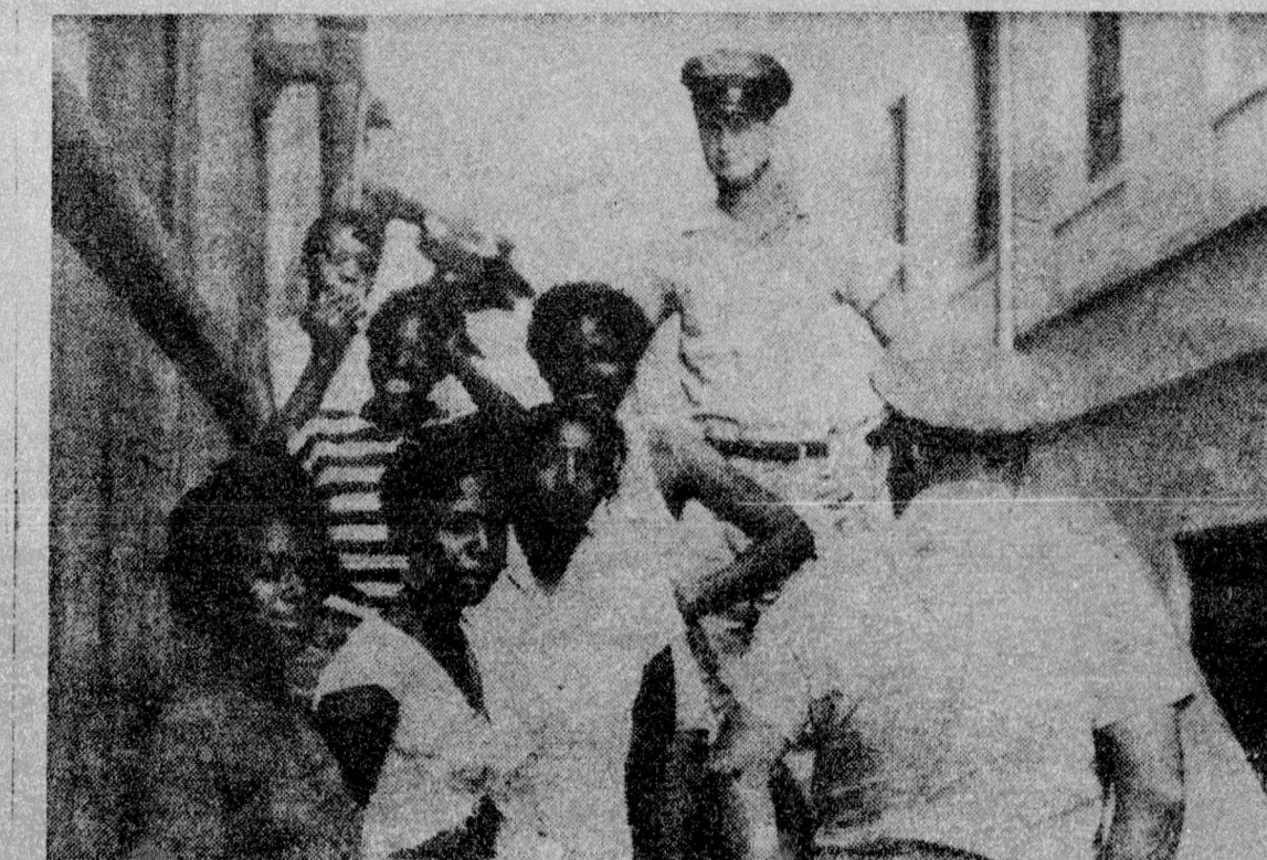
PRISON RIOT SCENES—Photo on left shows group of inmates at Women's Prison who

escaped from the Raleigh institution Saturday but were quickly rounded up. Included in photo