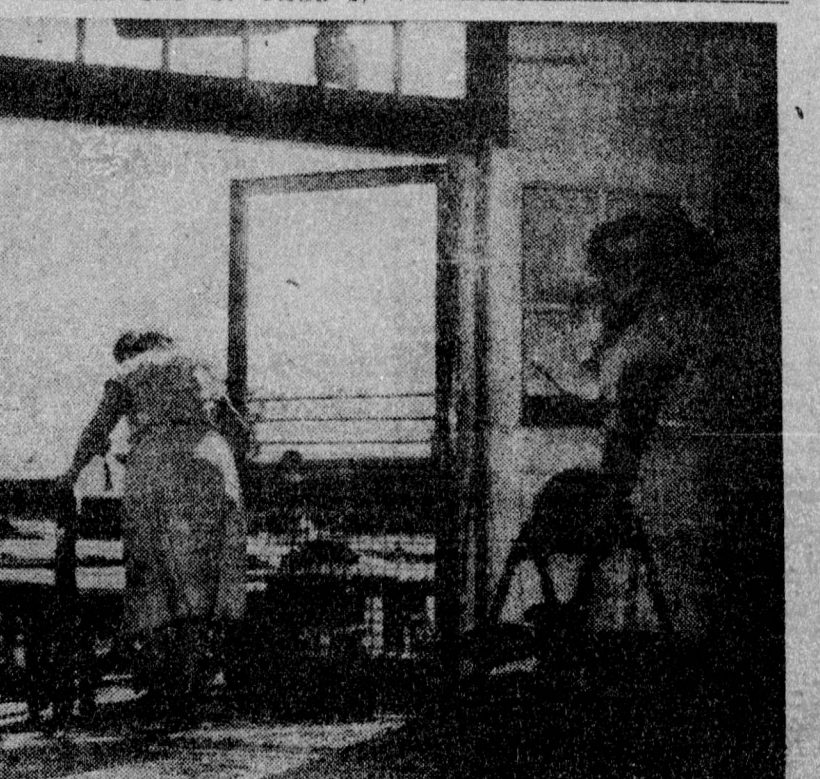
photo on right shows matrons at institution cleaning up after

before riot began, allegedly as a rebellion against cold food, and