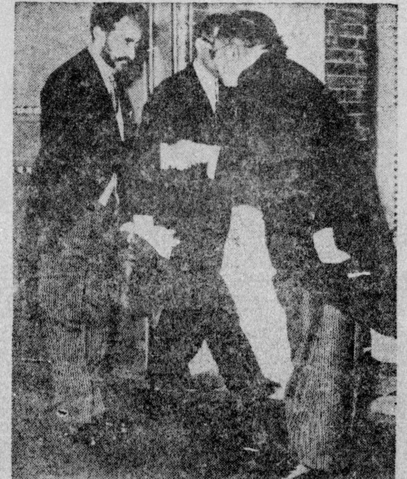
MEETING OF MONARCHS — The heads of the world's two oldest royal families, Emperors Haile Selassie (left) of Ethiopia and Hirohito of Japan, shake hands during an unprecedented meeting in Tokyo airport recently. Emperor Selassie and a party of 20 made a 10-day visit in Japan while touring the Far East.