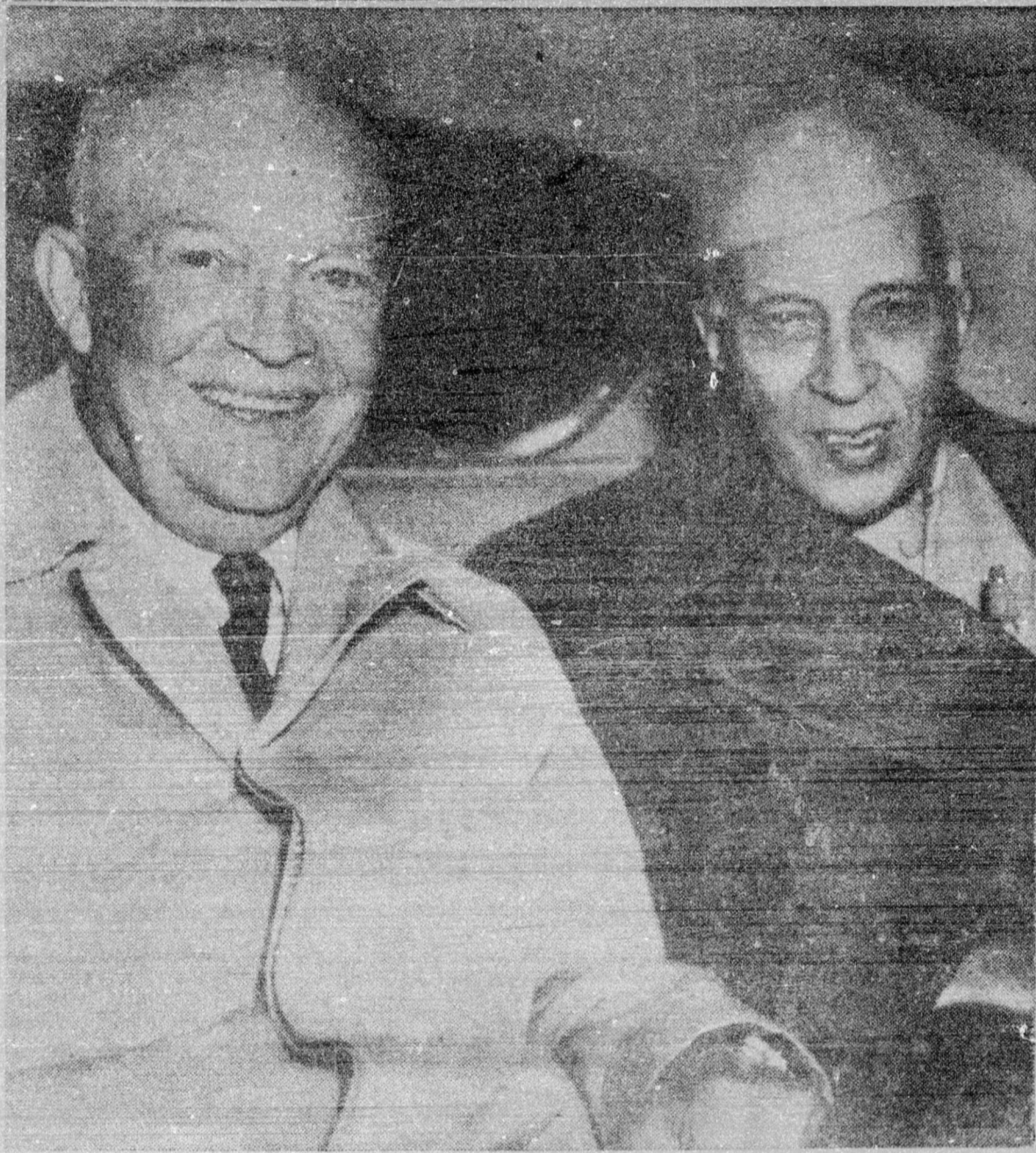
DISCUSS WORLD PROBLEMS—President Eisenhower and Indian Prime Minister Nehru as they left White House for the President's Gettysburg (Pa.) farm where they held private talks Tuesday on world problems.