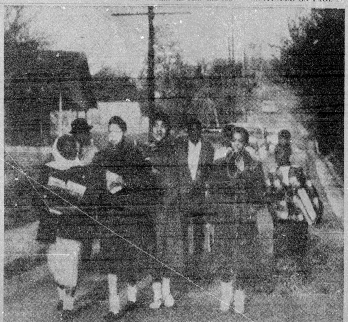
BACK TO CLASSES—Clinton High School students shown as they returned to class in Tennessee last week. There were no incidents and white students were warned against a repetition of acts such as filthy language, anonymous letters and "messing up" the lockers of the Negro students.