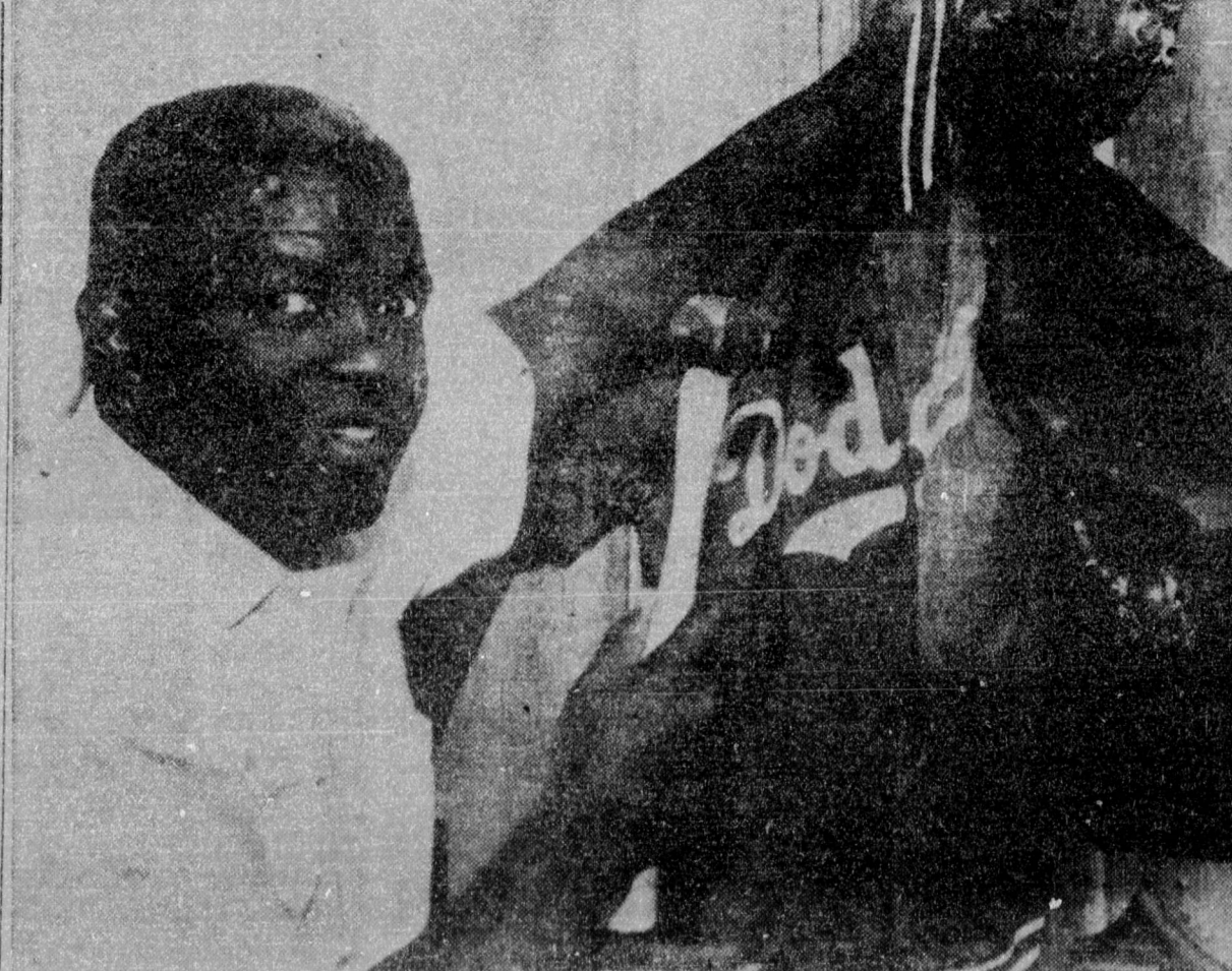
QUITS FOR GOOD — Jackie Robinson, for 16 years a star of the Brooklyn Dodgers baseball team finds a place to hang up his jacket and glove on the wall of the recreation room of his Stamford, Conn., home. Robinson, traded to the New York Giants recently, announced his retirement from the sport in which he pioneered in an article in Look magazine. (CONTINUED ON PAGE 2)