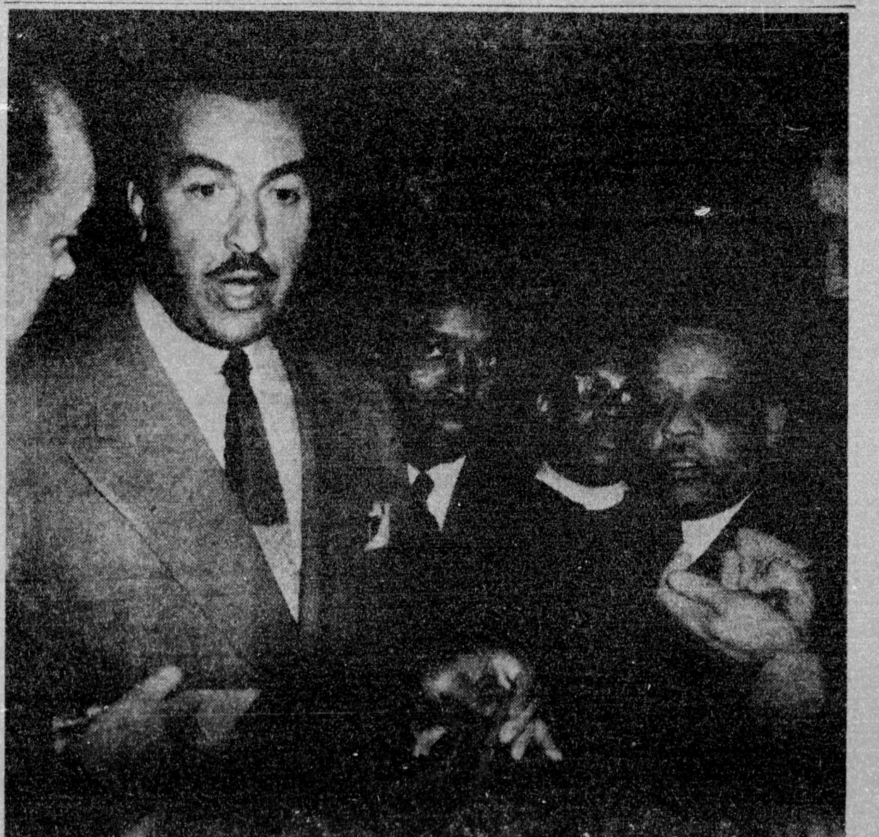
RESTORED TO GOOD STANDING — Rep. Adam Clayton Powell, Jr. (D.N.Y.) second from left, who bolted the Democratic party in November, is shown talking to reporters after leaving a Democratic caucus in Washington, which restored him to good party standing with no more than a verbal slap on the wrist. In background are some of the ministers who converged on the nation's capital in the Congressman's behalf.