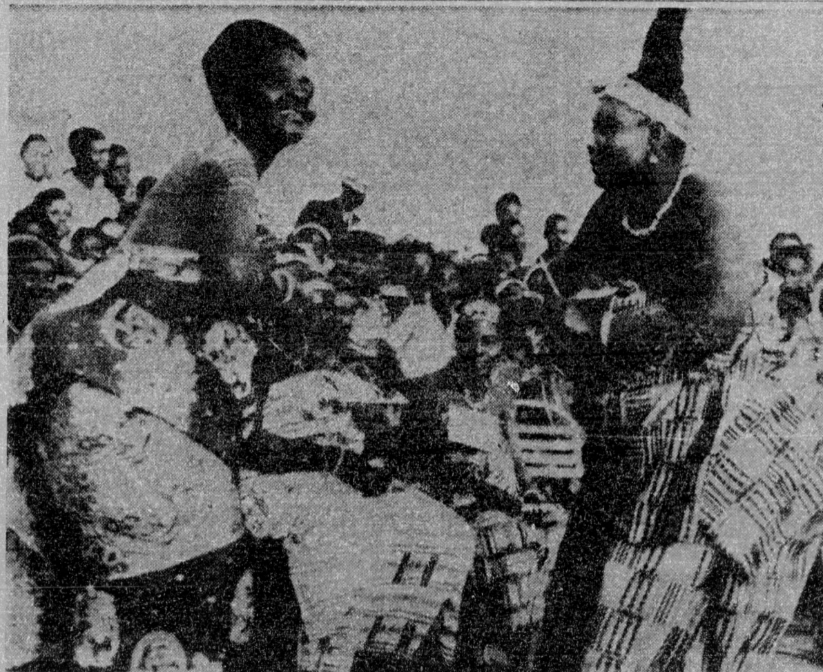
SWING AND SWAY, GOLD COAST WAY —Propelling their personages in uninhibited style, these two hefty matrons dazzle amused onlookers at Accra with some snappy Gold Coast grating during an exhibition of traditional native dancing. They were participating in a contest staged in connection with the celebration of Independence Day of Ghana on Wednesday.