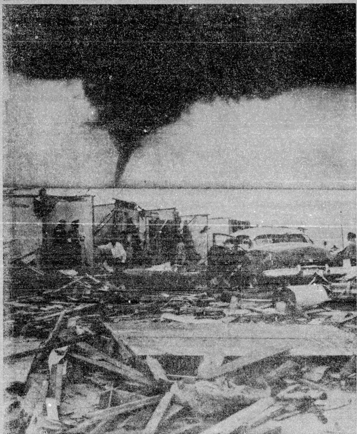
WHEN A TORNADO STRIKES — Top photo shows deadly funnel of tornado that cut a wide path across Dallas, Texas, last week, killing four persons and injuring scores of others. Bottom panel shows bewildered residents of the area as they examine shattered wreckage of their homes.