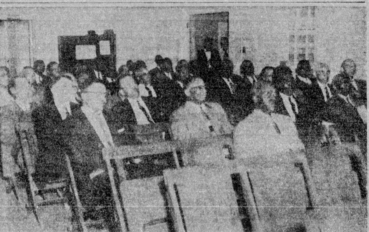
MINISTERS TO FIGHT JIM CROW — A portion of the ministers who gathered at the Martin Street Baptist Church