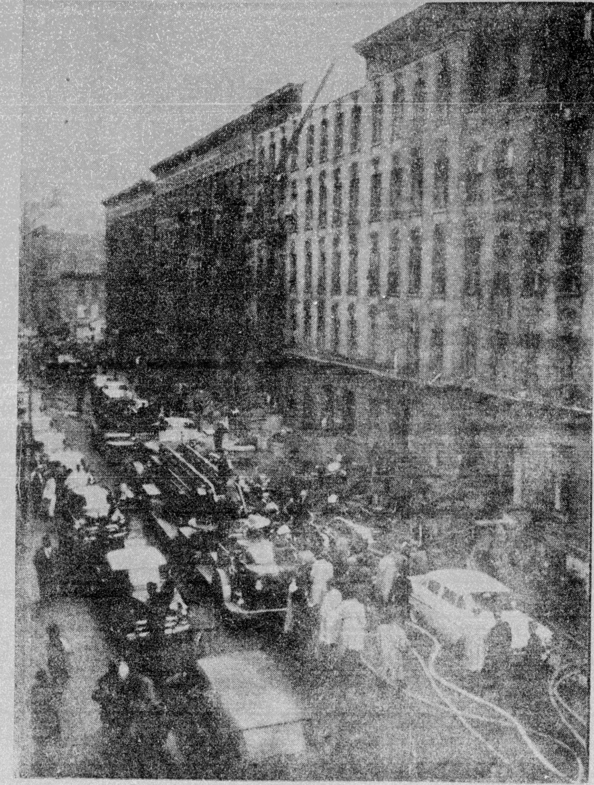
WHERE THREE DIED IN FIRE—General view of the scene where firemen last week battled a flash fire that turned two adjoining Harlem tenement houses into a night furnace, killing three persons, one a 22-month-old baby—and injuring five others.