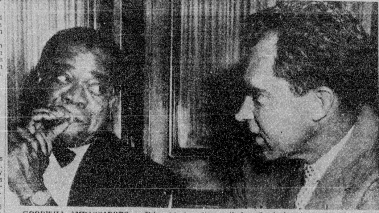
GOODWILL AMBASSADOR — Using his favorite mouthpiece, Louis Armstrong, famed musician (left) demonstrates to Vice President Richard H. Nixon the techniques he uses to "make the horn cry." Armstrong leaves shortly on a goodwill tour of South America, Russia and Africa.