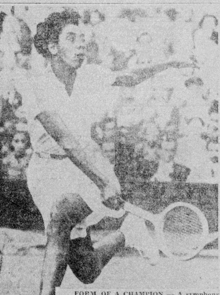
FORM OF A CHAMPION —A symphony of motion is depicted by tennis star Althea Gibson as she led U.S. net acts into the semi-final round at Wimbledon, England Saturday and emerged as the first Negro to win a championship there. Althea won the coveted women's singles after many years of unsuccessful attempts.