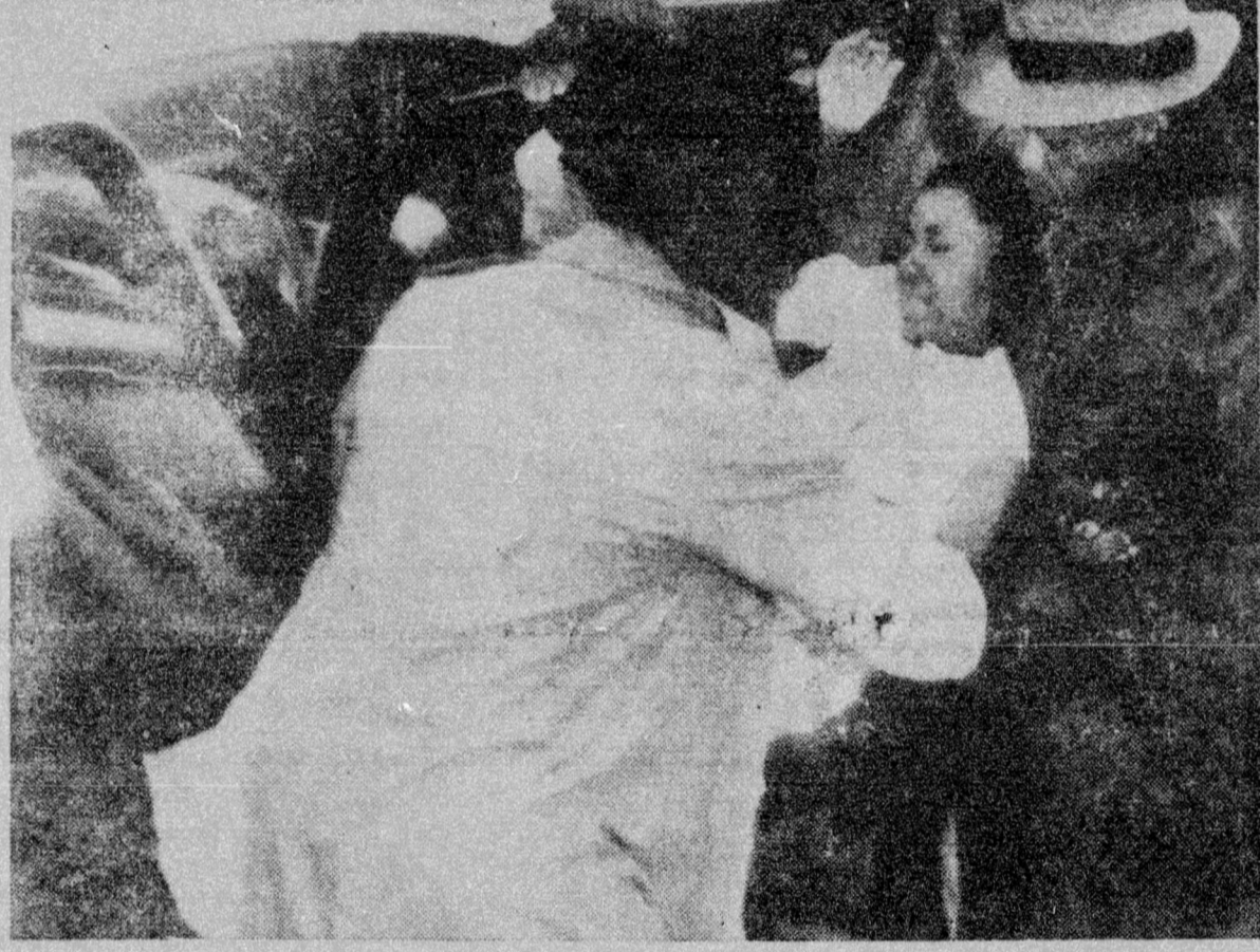
AMBULANCE, AUTO CRASH — Attendants lift a patient from an ambulance last week after the vehicle collided with a station wagon (rear) on one of Dallas, Texas' rain-slicked streets. There were no injuries as a result of the accident.