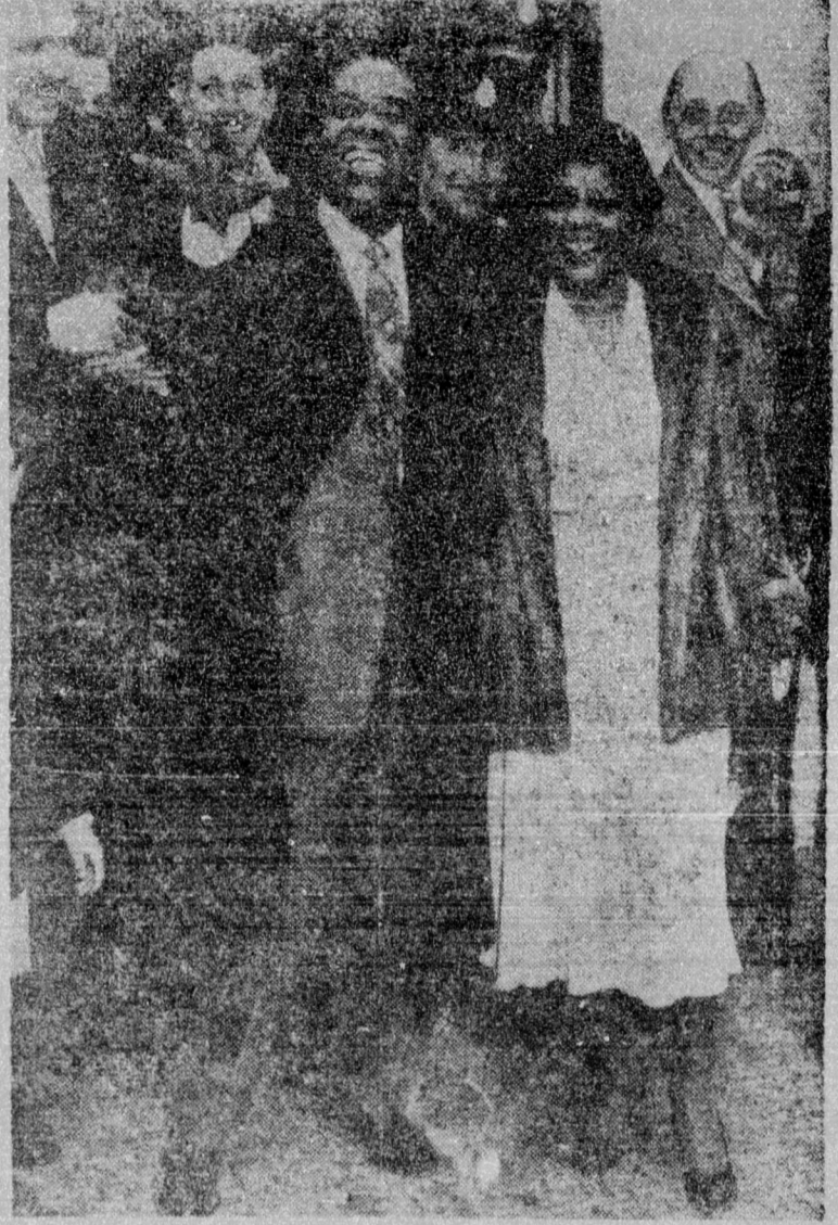
'SATCHIMO'S' NOT WELCOME—Shown here with his wife, Lil, when they arrived in London early this year for a European tour, Louis Armstrong is no less upset by the recent action of the University of Arkansas in cancelling out the trumpet star's scheduled concert on the campus. Armstrong's blast against Gov. Faubus of Arkansas made him "too controversial," the students alleged.