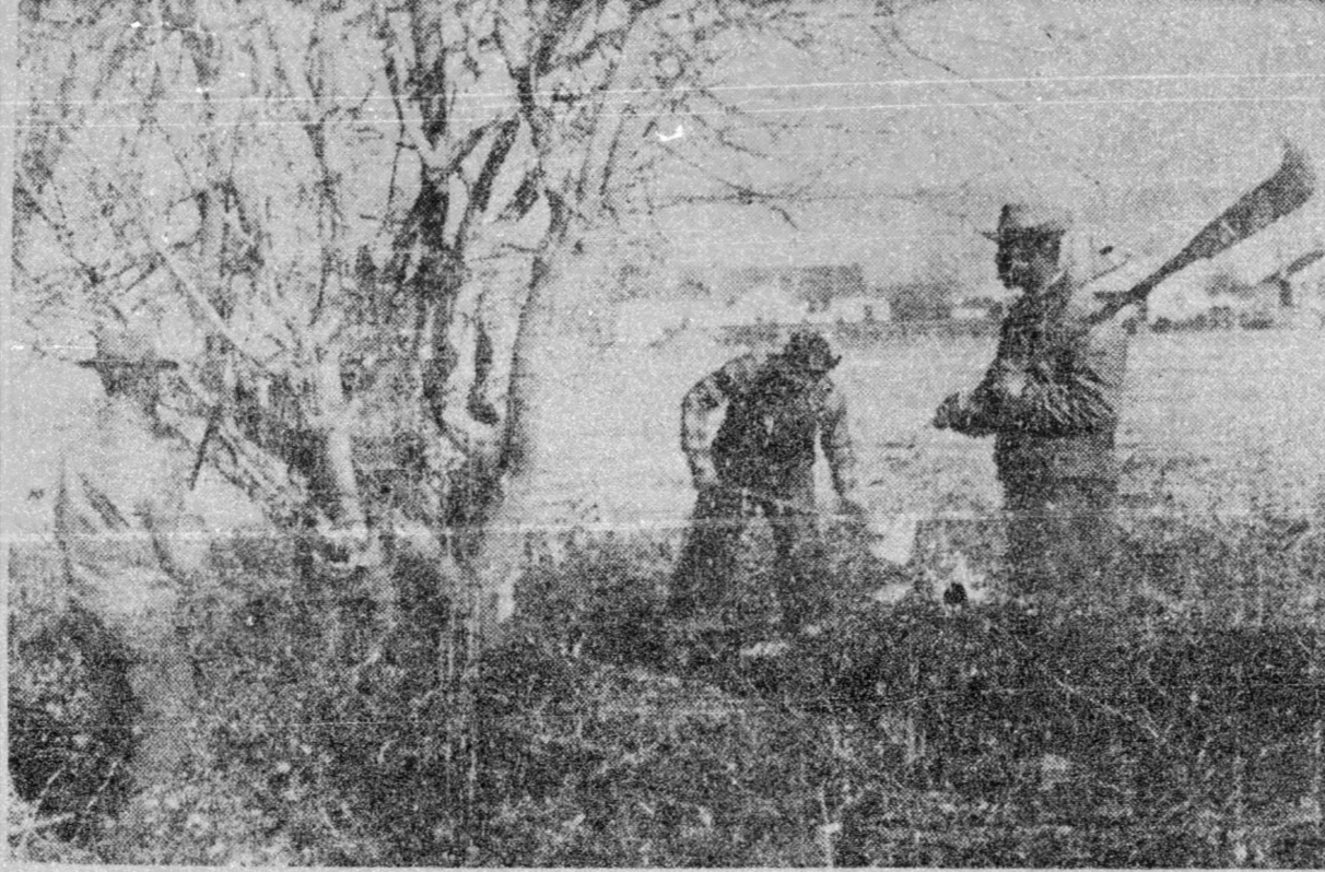
AREA CLEANED UP — City employees are pictured above last Saturday cleaning up the area located on the site of Lucille Hunter School, located in East Raleigh. This section, which was filled with tall weeds, trees and holes that contained rats, had been a menace to residents of the neighborhood for many years. It was also a hazard for young children who used a path beside the growth for traveling to and from school.