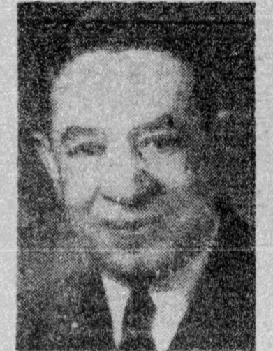
J. ERNEST WILKINS