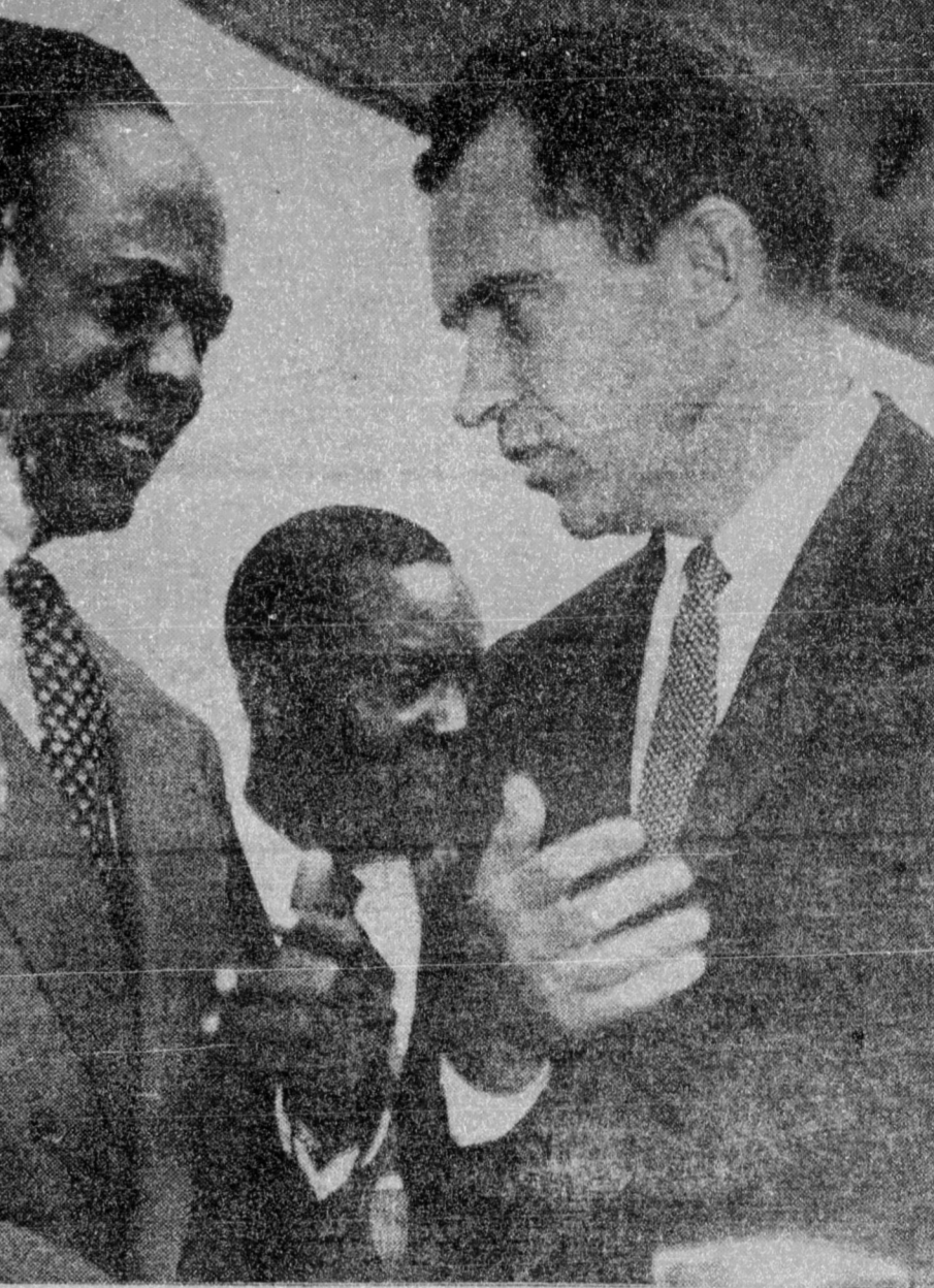
PRIME MINISTER OF GHANA ARRIVES — Prime Minister Kwame Nkrumah of Ghana arrived in Washington for a three-day state visit Wednesday, and called immediately for a Summit Conference in the United Nations on the Middle East Vice-President Richard M. Nixon is shown as he greeted the visitor at the Washington Airport.

Churches which have been awarded Bonus Money awards recent