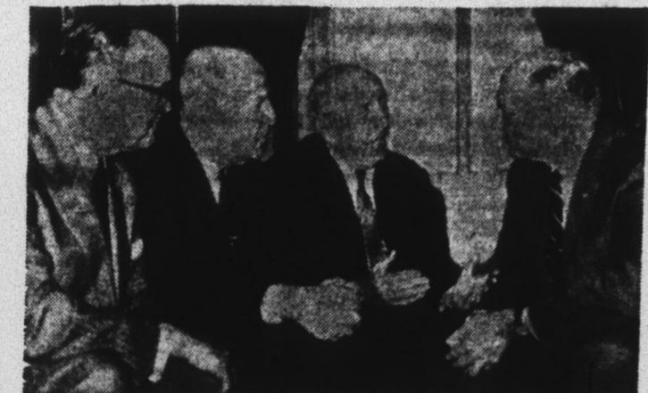
FOR FEDERAL AID — Housing Administrator Robert C. Weaver is shown as he appeared before the Senate Banking Committee in Washington recently, which opened week-long hearings on the Administration's drive for increased federal aid to urban transit systems. The bill would broaden the Federal subsidy role in the field of rail and bus transportation.