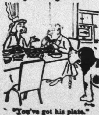
"You've got his plate."